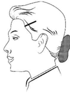
Figure 1: Female Gyalsup with long hair

All Gyalsups are advised to arrive at the Academy with their hair already cut to the above specifications. Gyalsups must maintain their hairstyle in accordance with regulations throughout their training period.