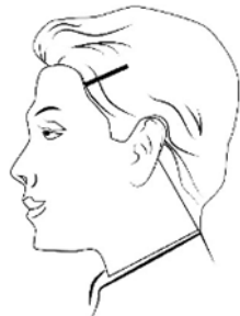
Figure 2: Female Gyalsup with short hair

All Gyalsups are required to maintain proper hair standards during their time at the Academy. Male Gyalsups must keep a crew cut, with hair length not exceeding one inch on top and closely trimmed on the sides and back that approximately corresponds to Zero and One scale on the electric Hair clippers. Female Gyalsups are strongly encouraged to keep their hair short for hygiene and convenience. Those choosing to keep long hair will be required to adhere to military-style bun that does not extend below the collar as shown below.